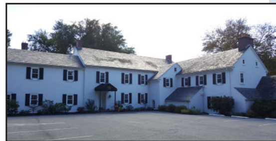
The Weyhill Guest House, a historic PA landmark