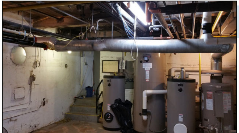
Two new Aqua Plus water heaters in the Weyhill Guest House boiler room