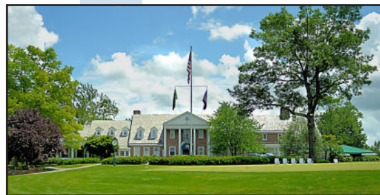
The Saucon Valley Country Club, founded in 1920