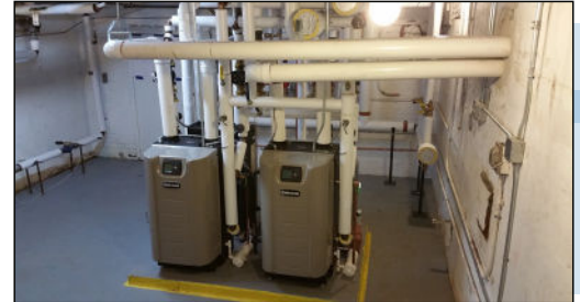
Three new Evergreen 399 boilers in the Weyhill Guest House boiler room