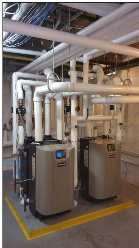
Three new Evergreen 399 boilers in the Weyhill Guest House boiler room