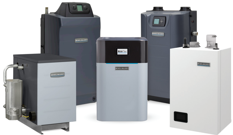
GV90+®, Ultra®, ECO® Tec, Evergreen® & Simplicity™