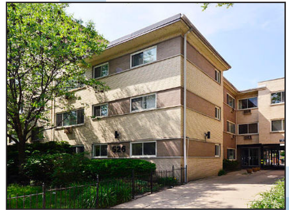
Belmont Harbor Condominiums in Chicago, IL

The building’s heating system featured a one million BTU boiler operated via an outdoor reset control and a 400,000 BTU/hr direct water heater with a 100-gallon storage tank. The individual condo units are heated by hot water baseboard heaters.