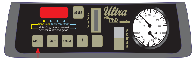
Figure 1 Ultra boiler digital display