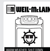
WARM WEATHER SHUTDOWN