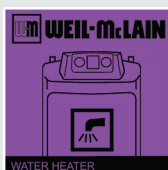
WATER HEATER PROVIDING HOT WATER