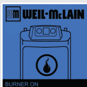
BURNER ON PROVIDING SPACE HEATING