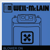
BLOWER ON START/END OF HEATING CYCLE