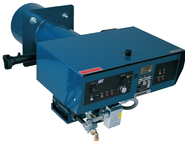
Figure 1 Model WJA