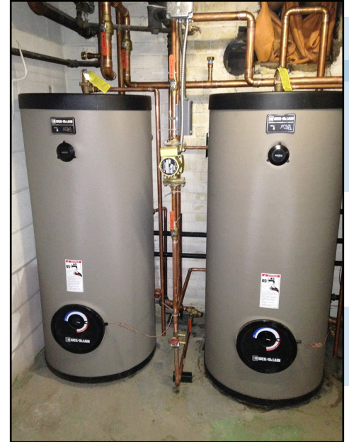
New Aqua Plus water heaters in the Belmont Harbor Condominiums boiler room

The upgrade also included the installation of two Weil-McLain 80-gallon Aqua PLUS® indirect-fired water heaters to replace the existing direct-fired water heater and storage tank. The Aqua PLUS units feature high output stainless steel heat exchangers that deliver superior first hour ratings and recovery. The units’ compact size allows for easy installation in low ceiling basements or storage rooms, and thermostat connections are already installed for quick wiring.