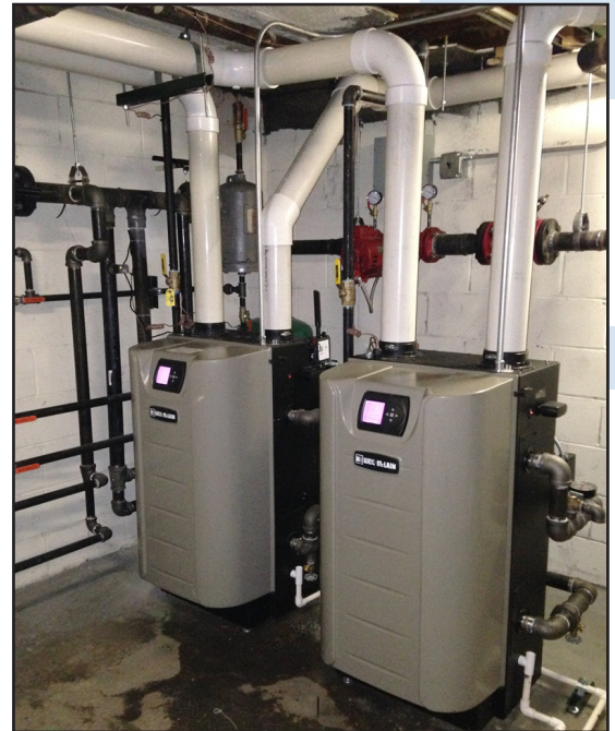
Two new Evergreen 399 boilers in the Belmont Harbor Condominiums boiler room