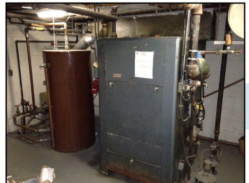
The existing boiler and water heater in the Belmont Harbor Condominiums boiler room

One of Nowak’s concerns early on was the interruption of hot water for tenants. Hayes Mechanical made sure access to domestic hot water was only out for several hours one day in the beginning of the project.