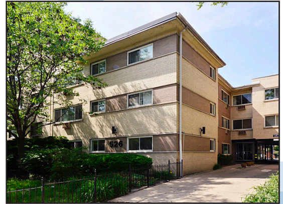
Belmont Harbor Condominiums in Chicago, IL

The building’s heating system featured a one million BTU boiler operated via an outdoor reset control and a 400,000 BTU/hr direct water heater with a 100-gallon storage tank. The individual condo units are heated by hot water baseboard heaters.