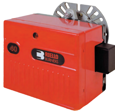
Model G400 - G900

Models G & RS Flame retention burner for gas firing