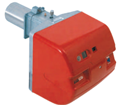
Model RS 28 - 50